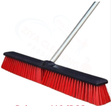
HARDY BRUSH 24/INCH