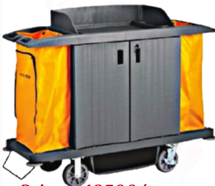
MULTIFUNCTIONAL SERVICE CART