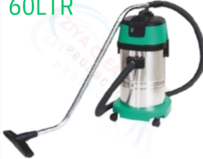
VACCUM CLEANER 60LTR