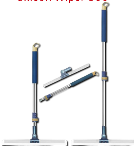
Silicon Wiper 360*