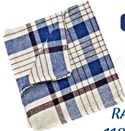
5-STAR CHECK DUSTER 20X20