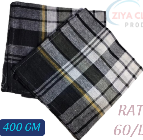
RUBI CHECK 18x18