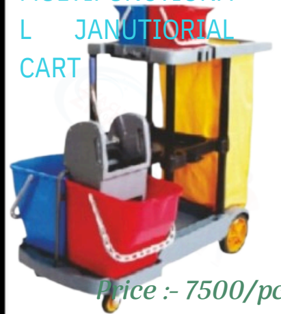
MULTIFUNCTIONAL JANITORIAL CART