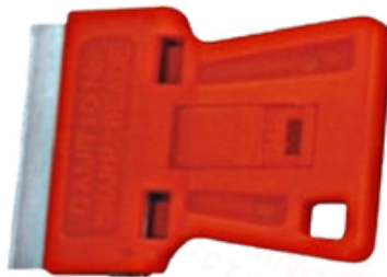
MINI POCKET SCRAPPER