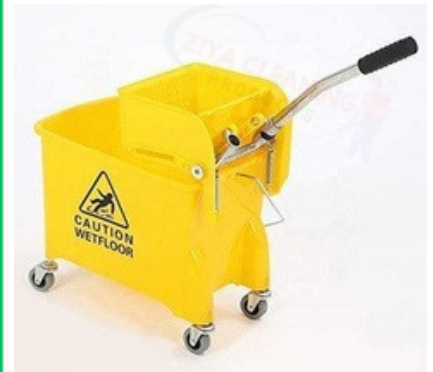
WRINGER TROLLEY 20LTR