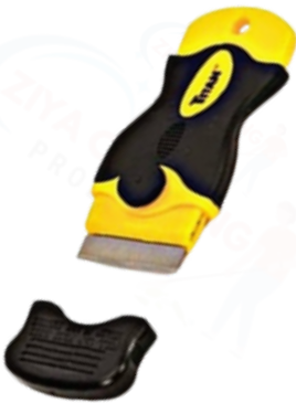
PLASTIC WINDOW SCRAPPER