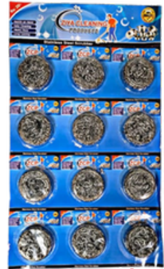
SS SCRUBBER PATTA