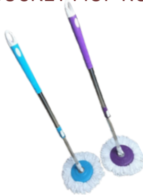
BUCKET MOP ROD