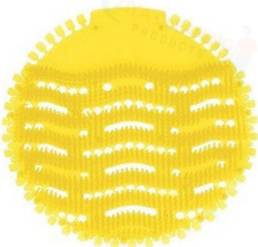
URINEL SCREEN MAT