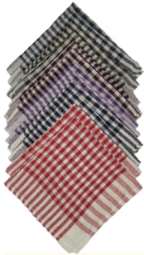
Check Duster 18x18