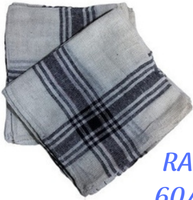
CHIRVA DUSTER 18x18