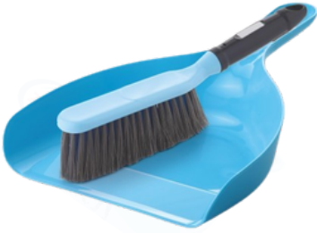
DUSTPEN WITH BRUSH