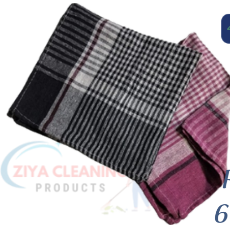
4 STAR CHECK DUSTER 18x18