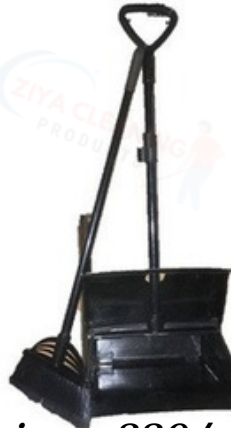
LOBBY DUST PEN