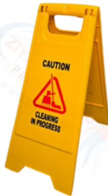
CUTION SIGN BOARD