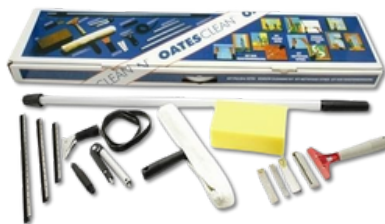
Glass Cleaning Kit