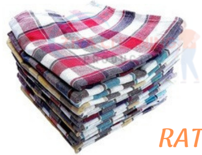
CHECK DE 20X20 600GM