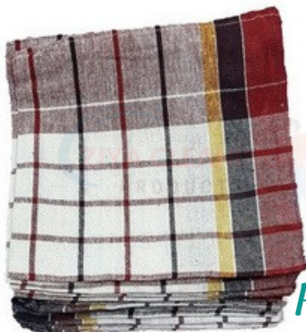
KAMAL CHECK DUSTER 20X20