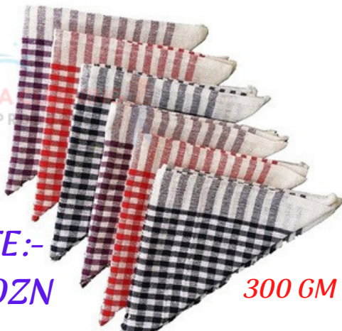
CHECK DUSTER 16X16 HEAVY