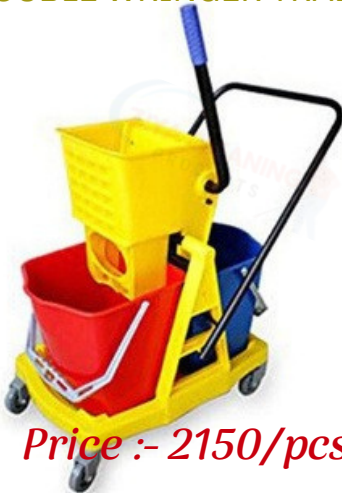
DOUBLE WRINGER TRALLY