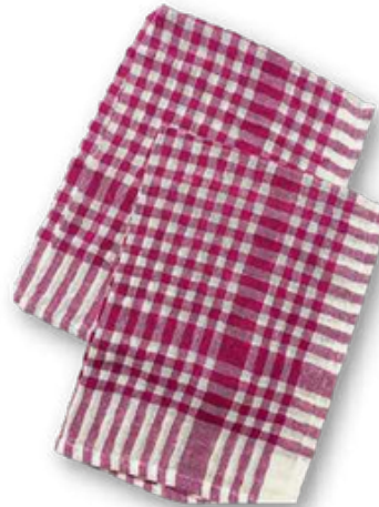
Check Duster 17x24