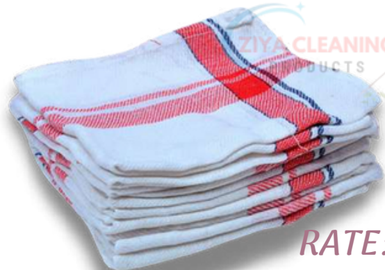
GLASS DUSTER 18x18