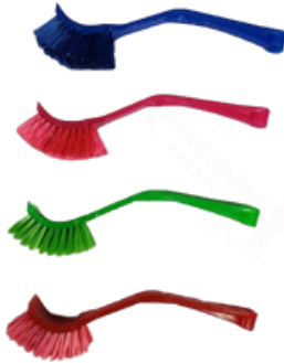
REGULER SINK BRUSH