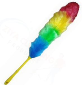
SMALL FEATHER DUSTER