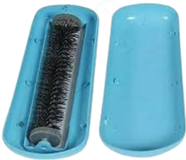
REGULER BED ROLLER