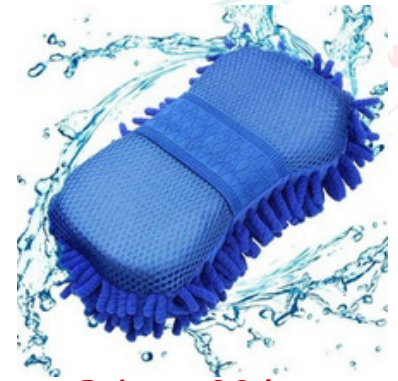
MICROFIBER CAR DUSTER