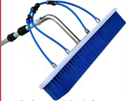
Solar panel cleaning brush with handle