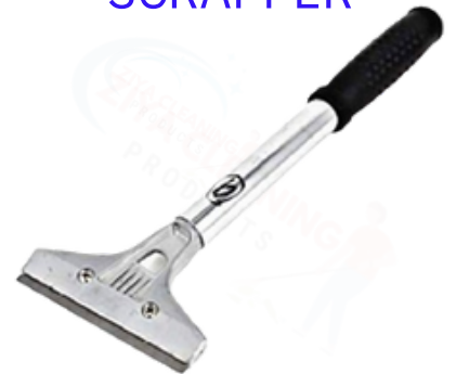
LONG HANDLE FLOOR SCRAPPER