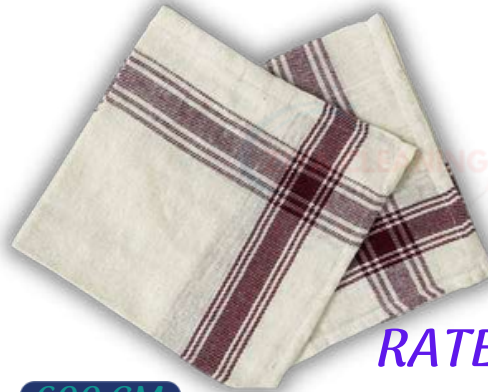
MEHROON HEAVY DUSTER 20X20