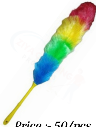
BIG FEATHER DUSTER