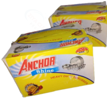
SS SCRUBBER 10/PCS BOX