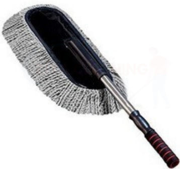
CAR DUSTER HANDLE