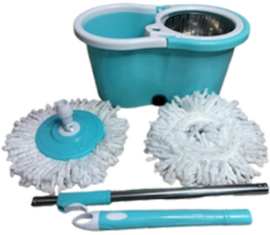
BUCKET MOP SET