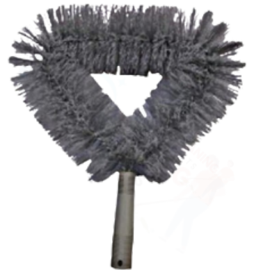
RINGED TUBE BRUSH