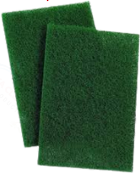
GREEN PAD 6X4 10/Pcs SET