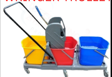
TRIPPLE BUCKET WRINGER TROLLEY