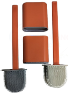
SILICON TOILET BRUSH